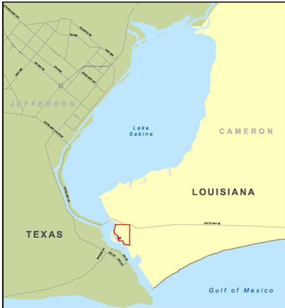
Figure 1.4-1 General Location Map

All proposed Project facilities will be located entirely within the 853-acre site previously leased in conjunction with the development of the existing SPLNG Terminal. The locations of the proposed facilities are depicted in Figure 1.4-1. A topographic map and aerial photography of the Project are included in Appendix 1A.