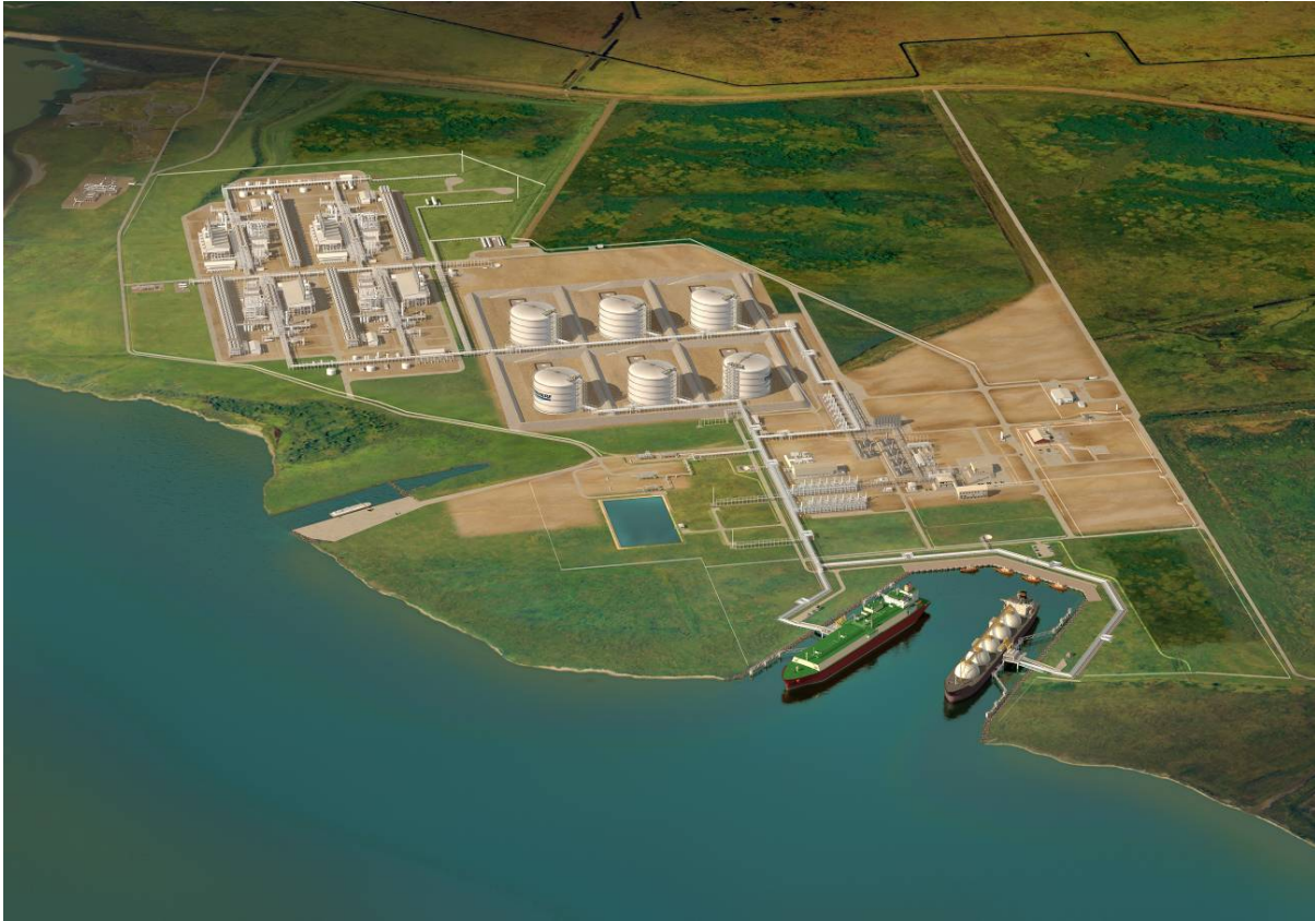
Figure 1.2-1 Liquefaction Project, Artist Impression Aerial View